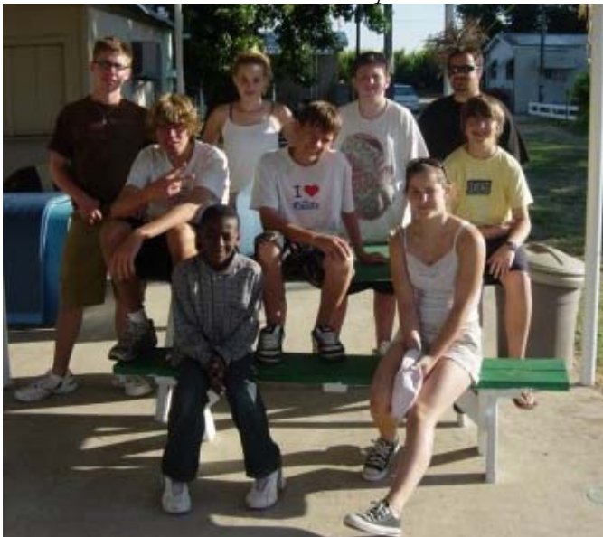
On the mission trip: