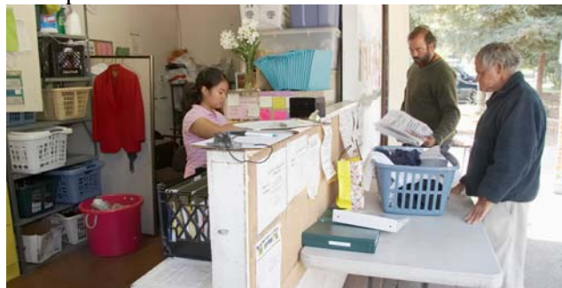
The Drop-In Center